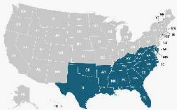
Region 3: South